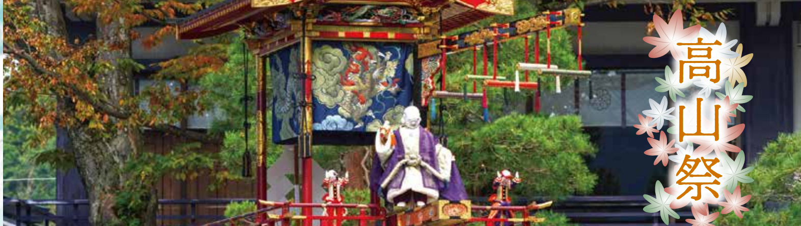
Registered as a UNESCO Intangible Cultural Heritage of Humanity